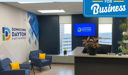
Downtown Dayton Partnership New Offices