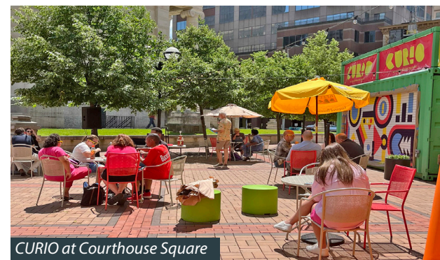
CURIO at Courthouse Square