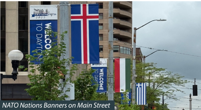
NATO Nations Banners on Main Street