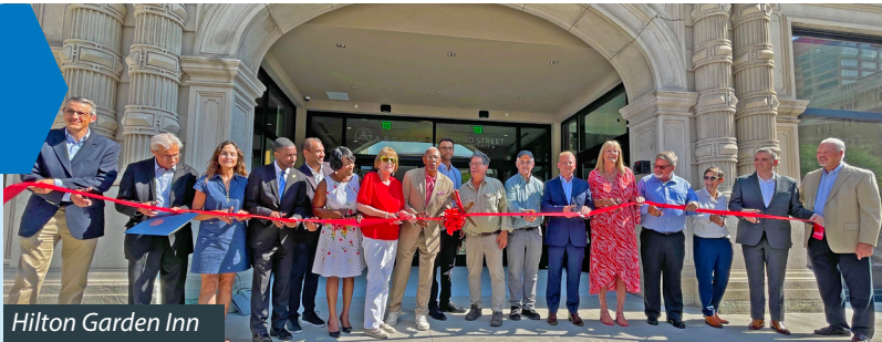
Hilton Garden Inn