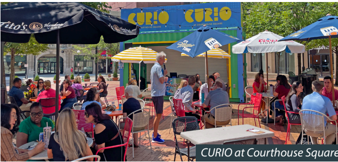
CURIO at Courthouse Square

Summer's a great time to get out and explore downtown Dayton, and there are still many events, festivals, and more fun activities to come as we wind up the season. Stay up to date on all downtown happenings this summer. Download a handy 2025 AES Ohio Summer in the City Events & Activities Guide at downtowndayton.org .