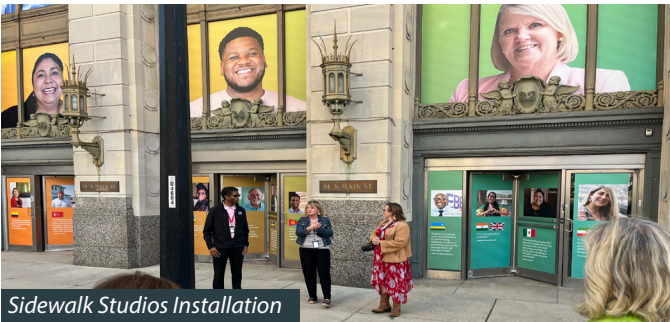
Sidewalk Studios Installation

For our special projects, we focused on improvements that could be enjoyed not just by our NATO guests, but also by our community for years to come. Some such projects included new pole banner infrastructure for Main Street, landscaping, and new public art, including storefront activations, a new Courthouse Square mural, and work to help bring the new Dayton Peace Sign to fruition.