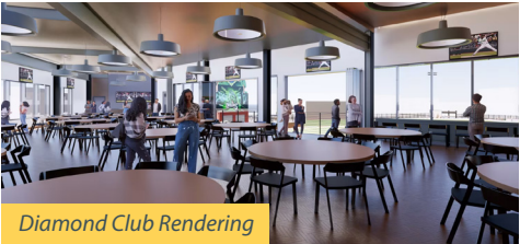
Diamond Club Rendering

The Dayton Dragons celebrated their 25th season and began construction on a new Dragons Diamond Club to provide elevated hospitality during home games and a rentable event space. Day Air Ballpark also was announced as the winner of the 2025 Newsweek Fans' Choice Award for Best Single-A Ballpark in the United States.