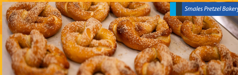
Smales Pretzel Bakery