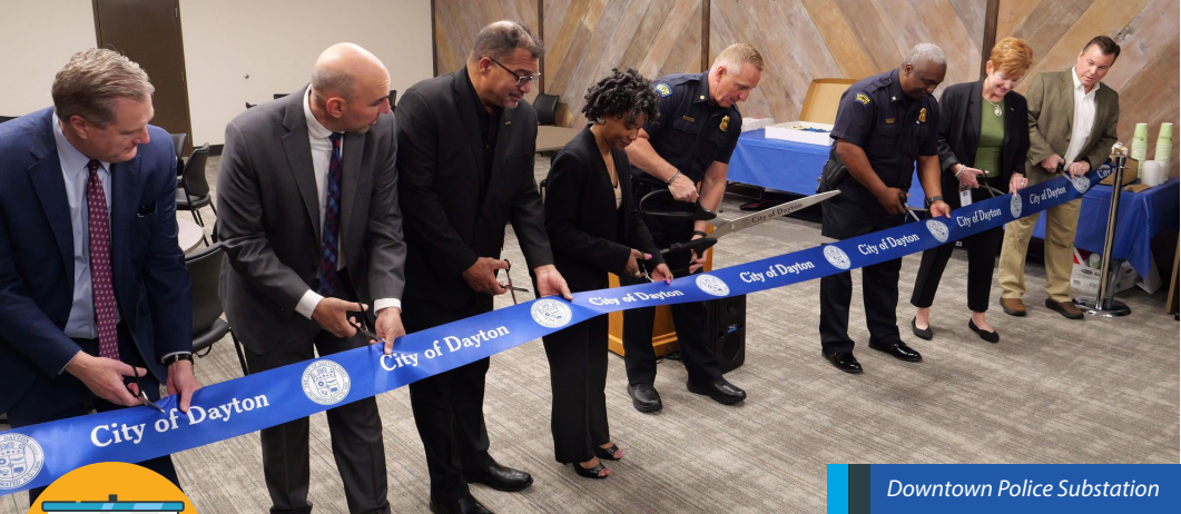
Downtown Police Substation