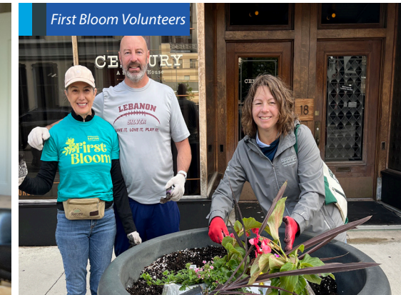
First Bloom Volunteers