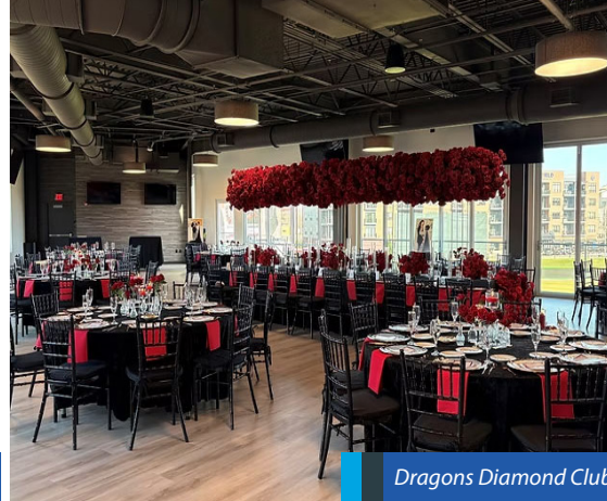
Dragons Diamond Club