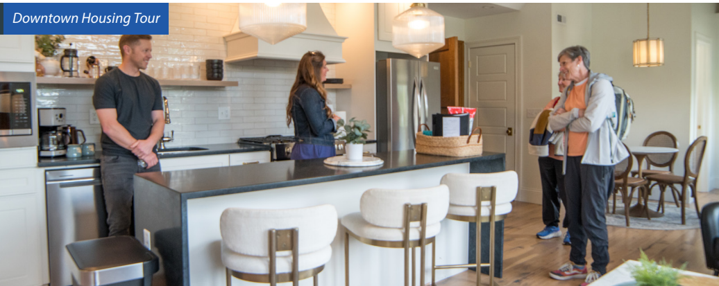
Downtown Housing Tour